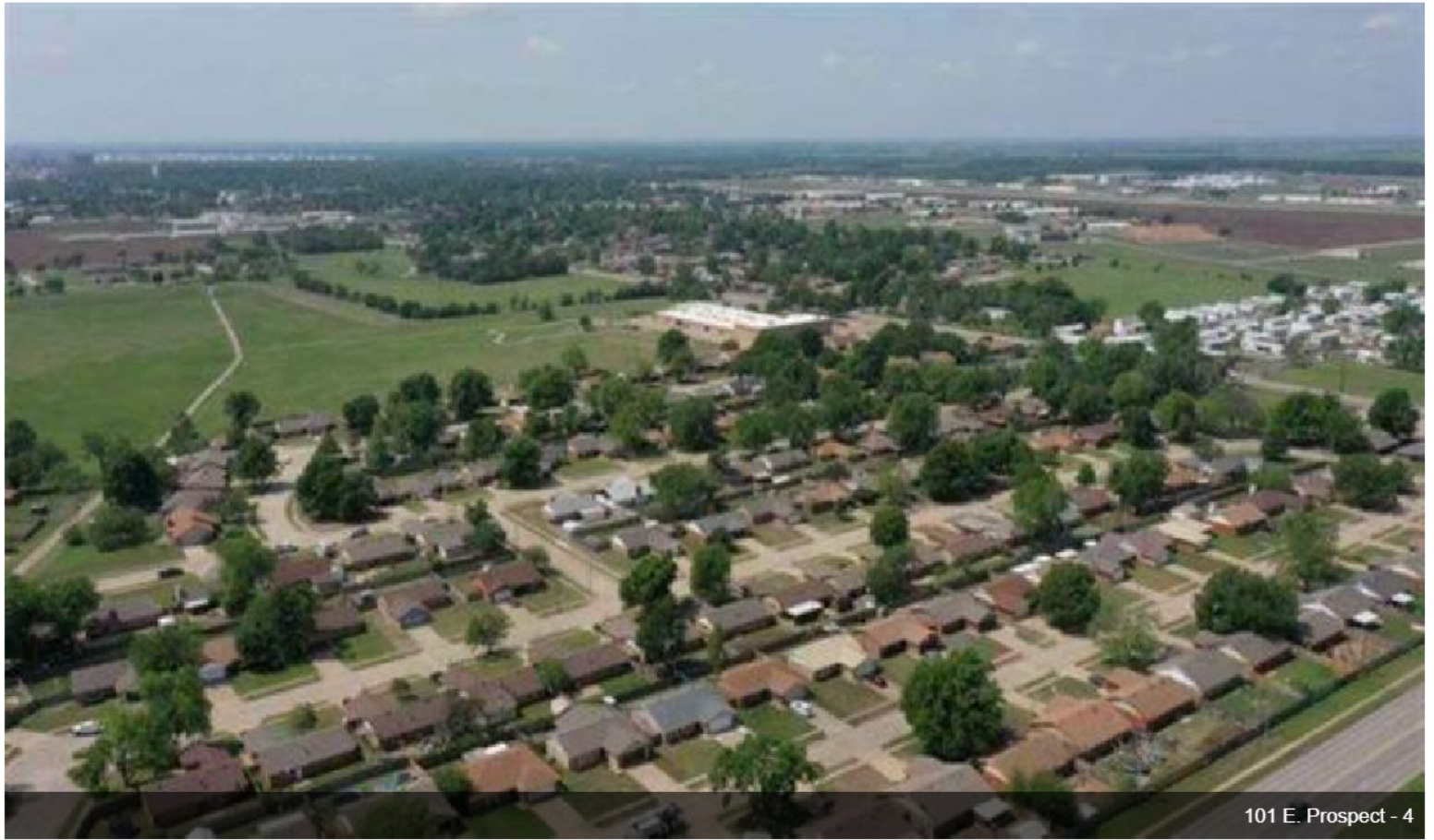
101 E. Prospect - 4