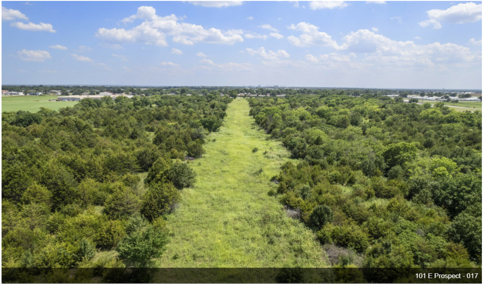
101 E Prospect - 017