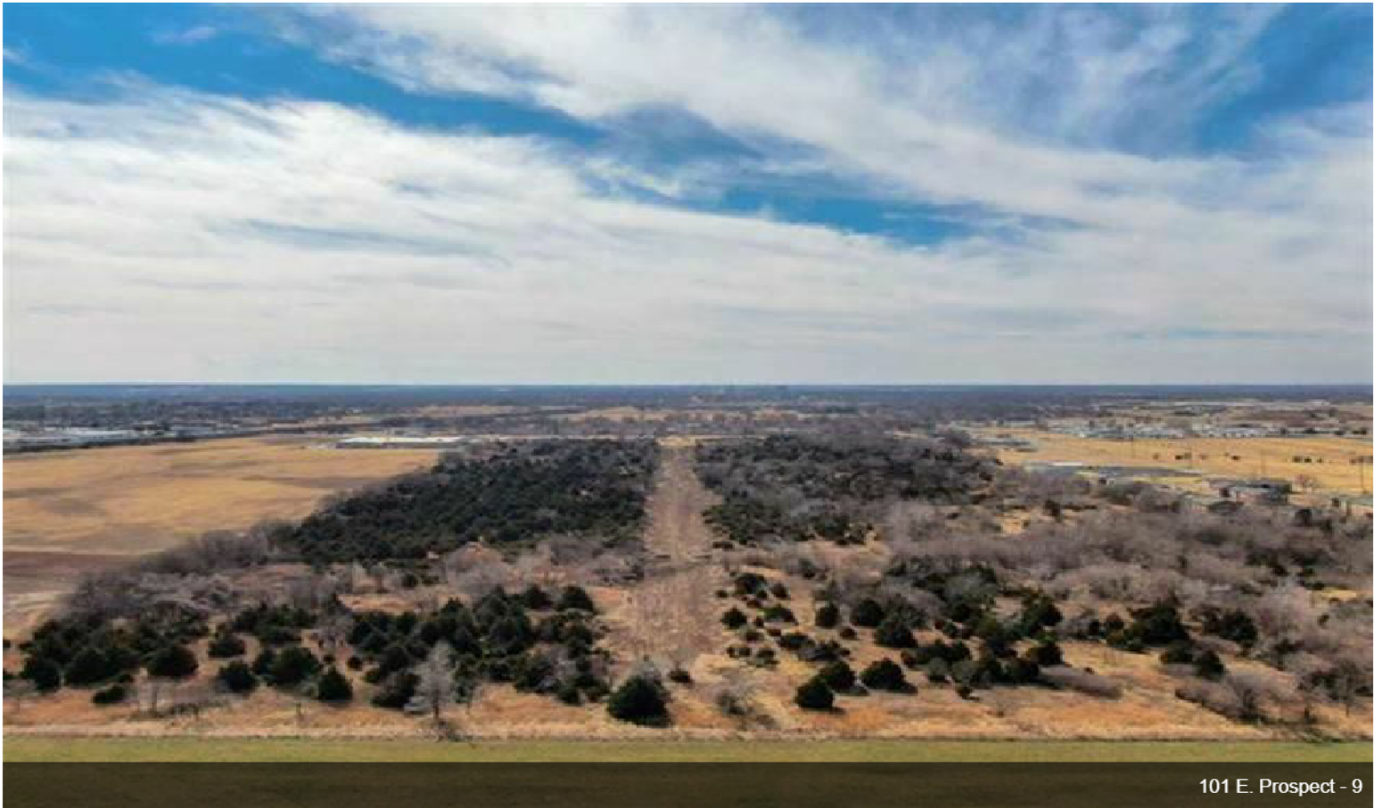
101 E. Prospect - 9