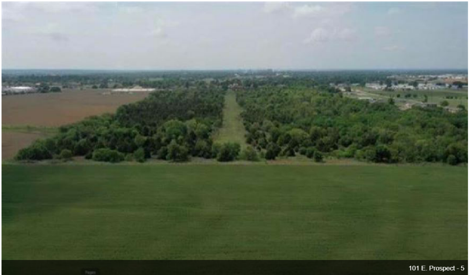
101 E. Prospect - 5