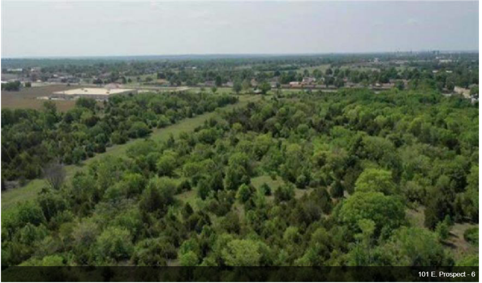
101 E. Prospect - 6