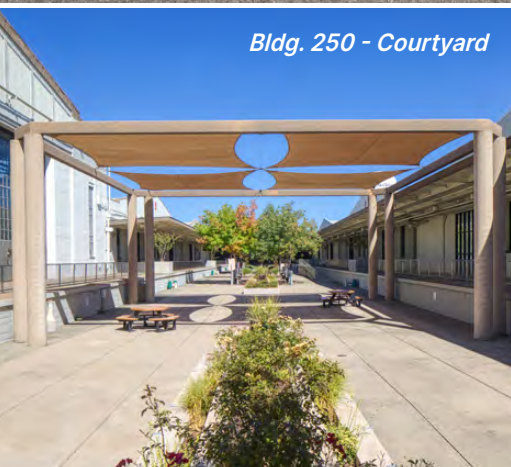
Bldg. 250 - Courtyard