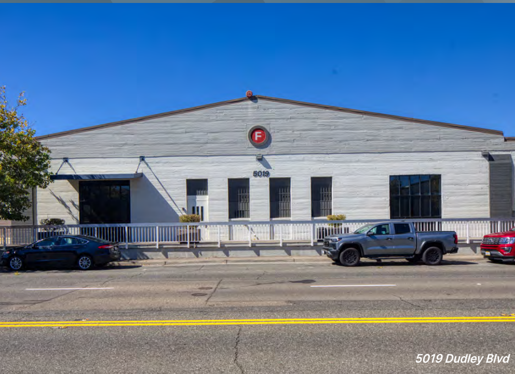
5019 Dudley Blvd