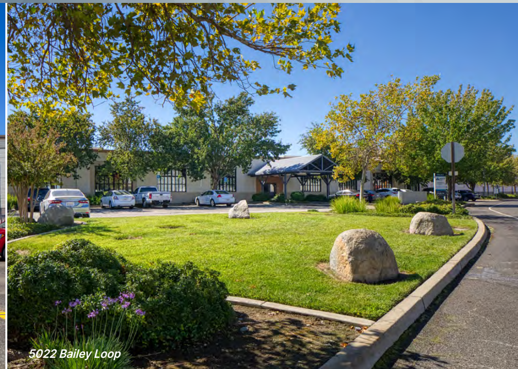
5022 Bailey Loop