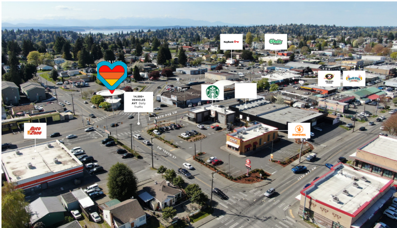
LOCATION: WHITE CENTER