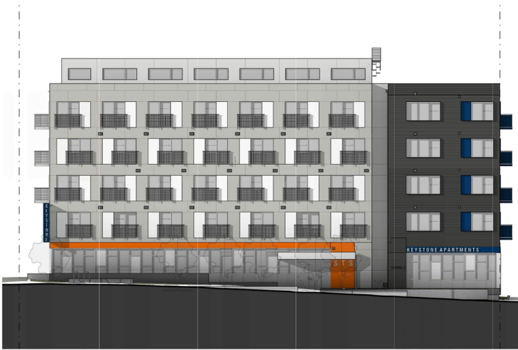
color elevation -north (sw barton st)