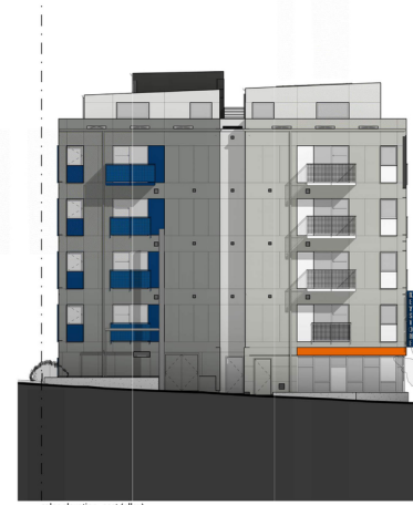
color elevation -east (alley)