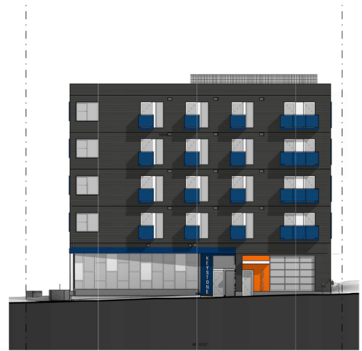
color elevation -west (20th ave sw)