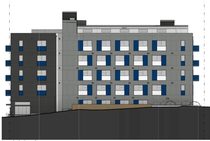
color elevation -south