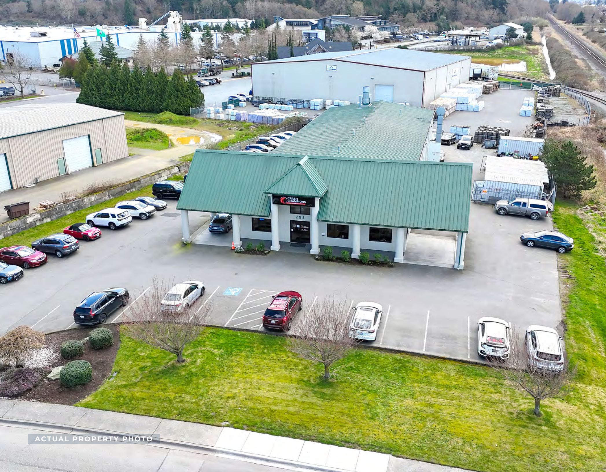
ACTUAL PROPERTY PHOTO