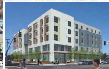
EBALDC HOUSING 95 UNIT DEVELOPMENT