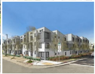
ARTHAUS BRUSH 18 UNIT DEVELOPMENT

The property is within walking distance to Uptown and Downtown. It is close to many restaurants, hotels & area amenities.