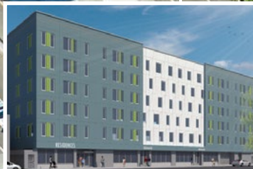
105 UNIT DEVELOPMENT DEVELOPER: OAKBROOK PARTNERS