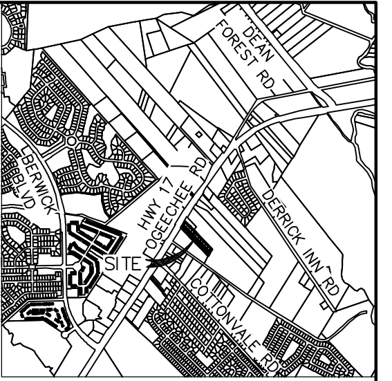
VICINITY NOT TO SCALE

THIS AREA RESERVED FOR CLERK OF SUPERIOR COURT