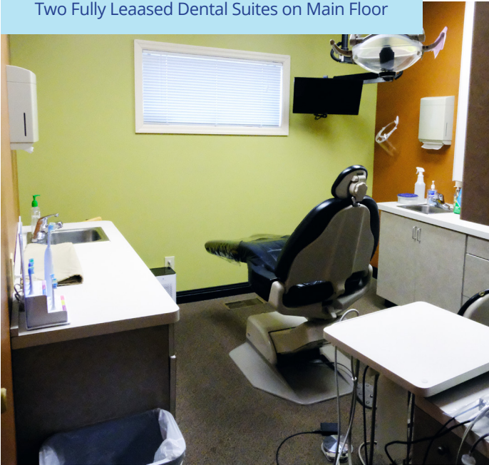
Two Fully Leased Dental Suites on Main Floor