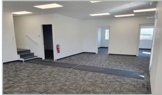
OFFICE SPACE Newly Remodeled