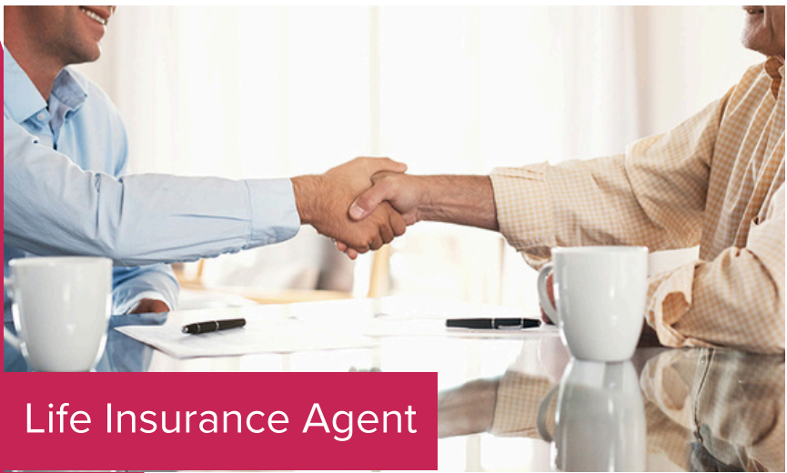
Life Insurance Agent