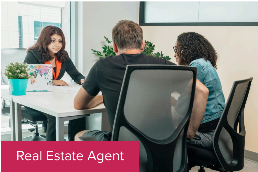
Real Estate Agent