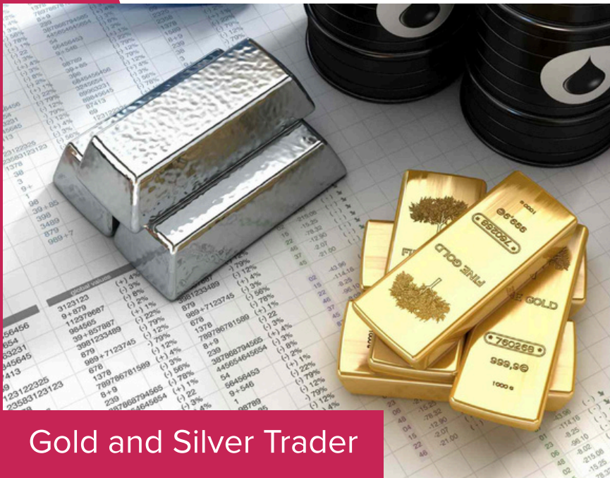
Gold and Silver Trader