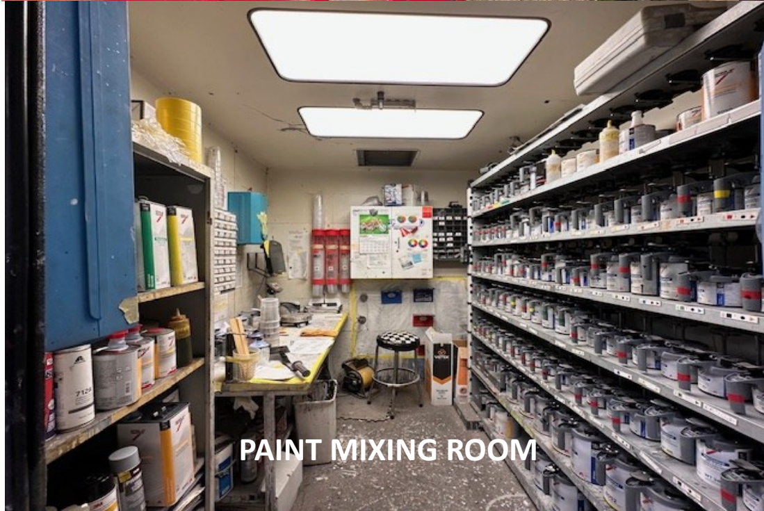
PAINT MIXING ROOM