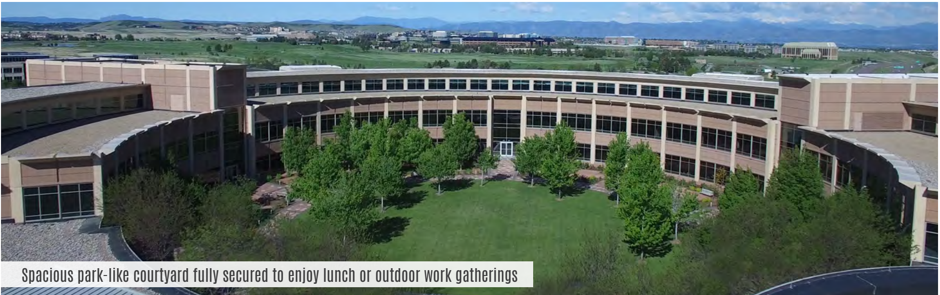
Spacious park-like courtyard fully secured to enjoy lunch or outdoor work gatherings