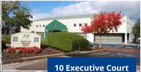
10 Executive Court