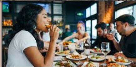
Fast Food & Dine-In