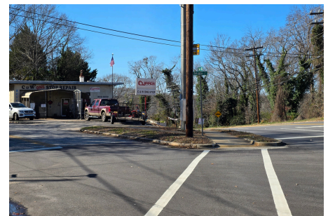
Each Office Is Independently Owned And Operated