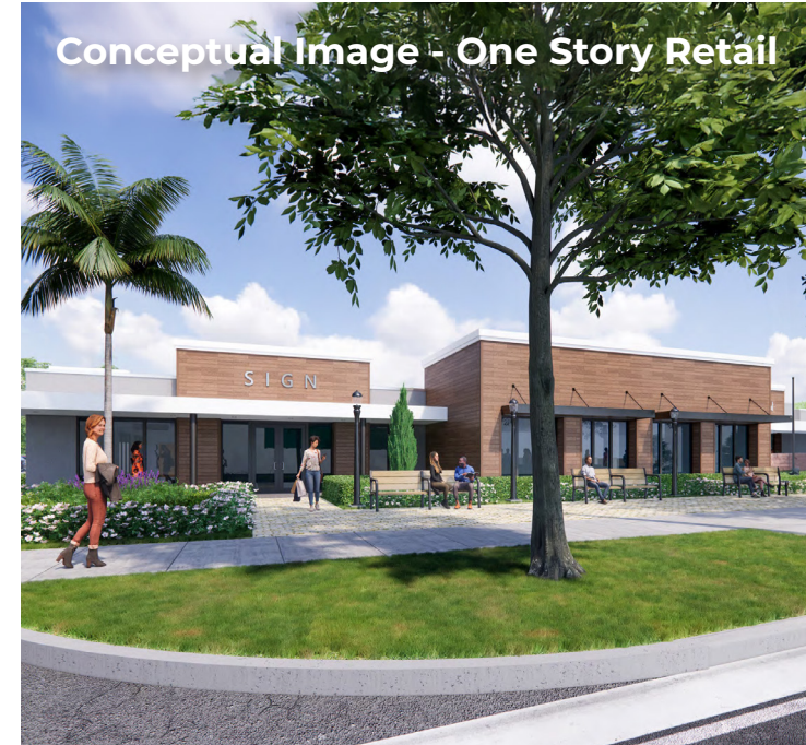
Conceptual Image - One Story Retail