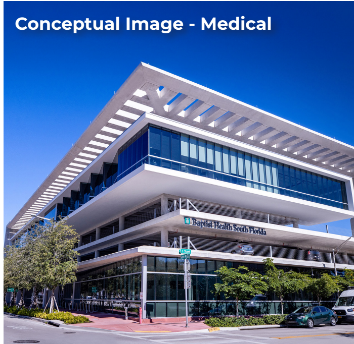
Conceptual Image - Medical