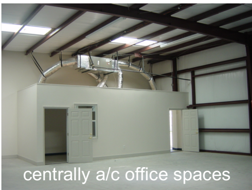
centrally a/c office spaces