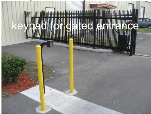
keypad for gated entrance