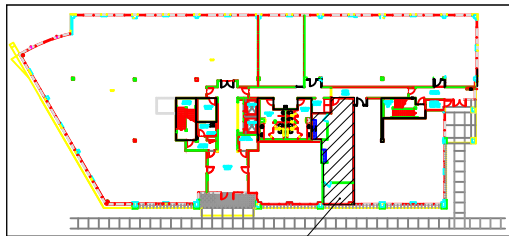
VACANT SUITE KEY PLAN