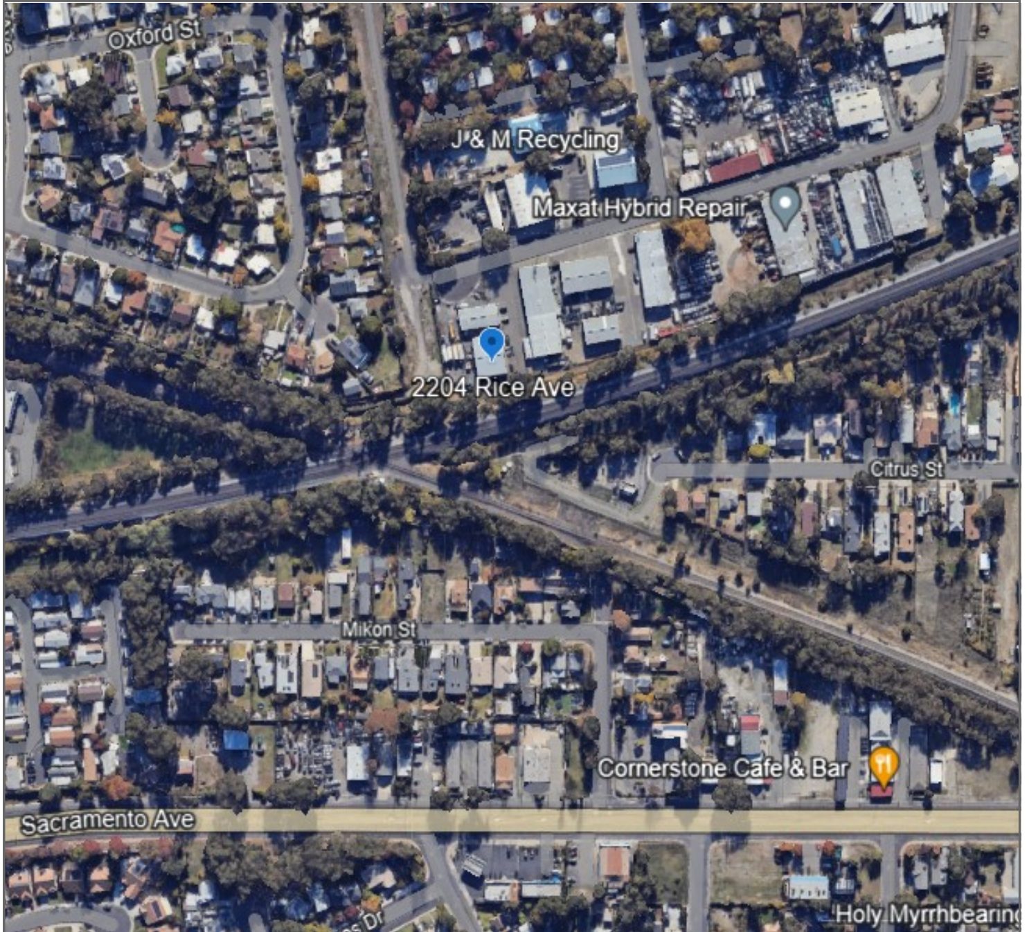
Aerial Property Location