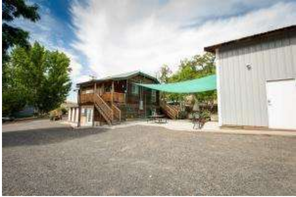
Back o House, Shaded Patio & Storage Shp