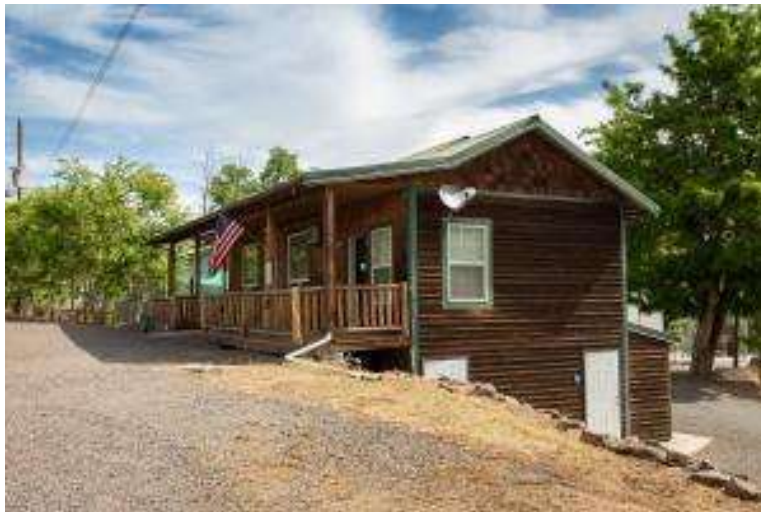
House Upper Flr, 2 Client Bthrms blw