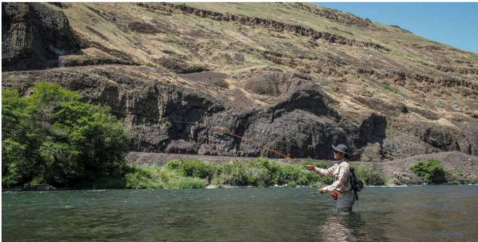
World Class Fishing