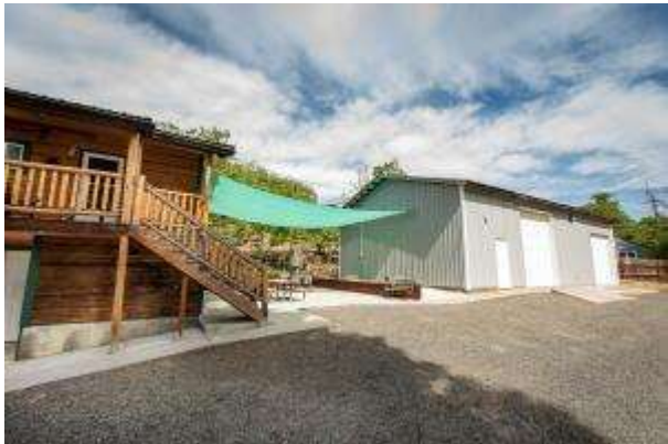
Shaded Patio, Storage & Shop 1