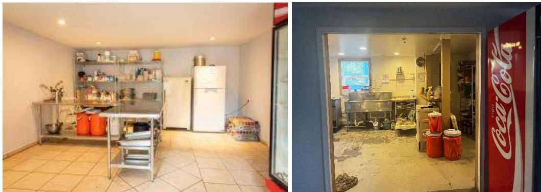
Prep Kitchen below main house