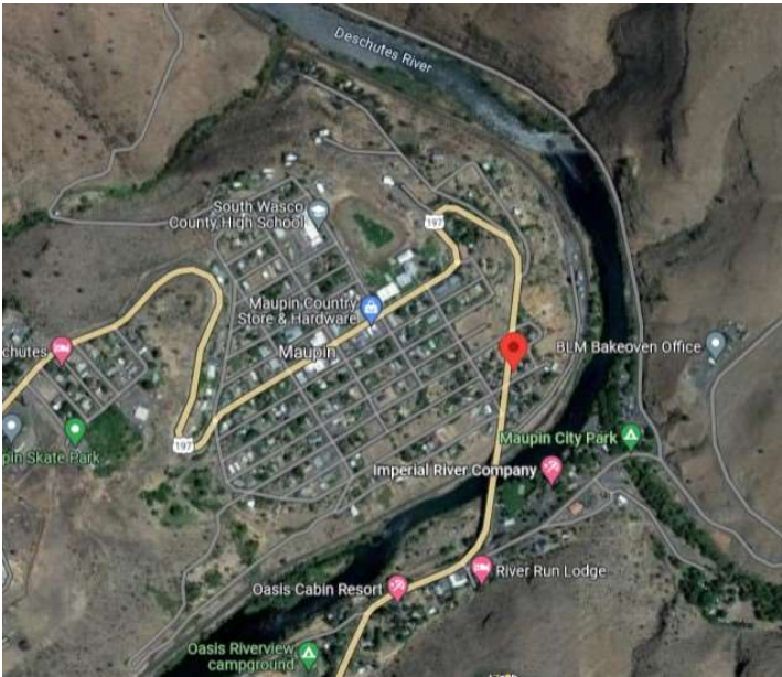
Maupin Area Map