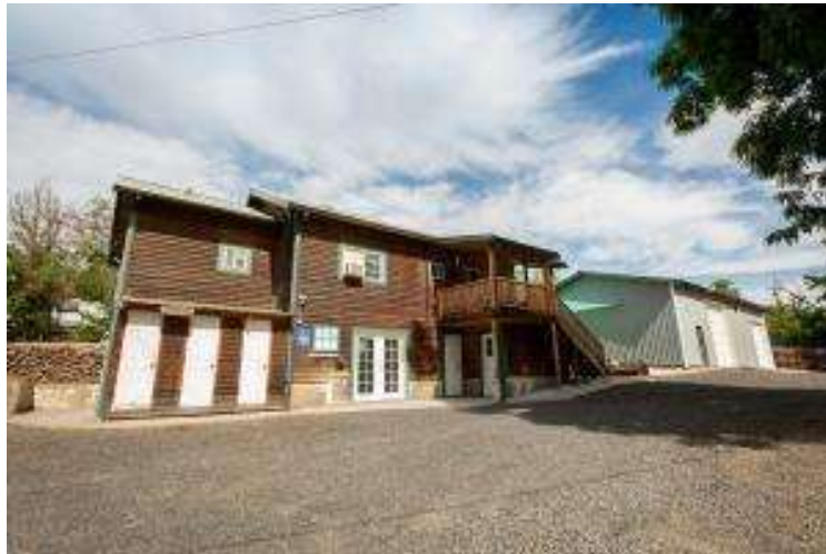
Back House, Chnging Rms & Prep Kitch blw