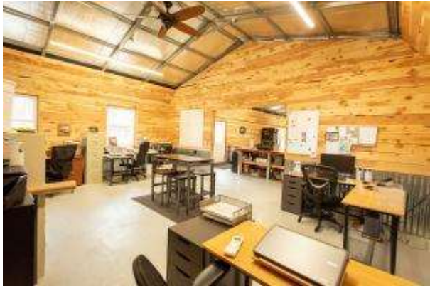
Office & Work Space 1