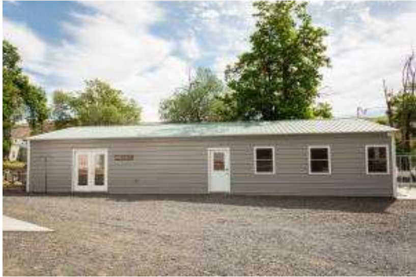
Sales Area & Office