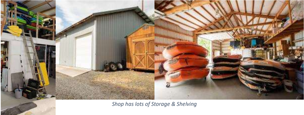
Shop has lots of Storage & Shelving