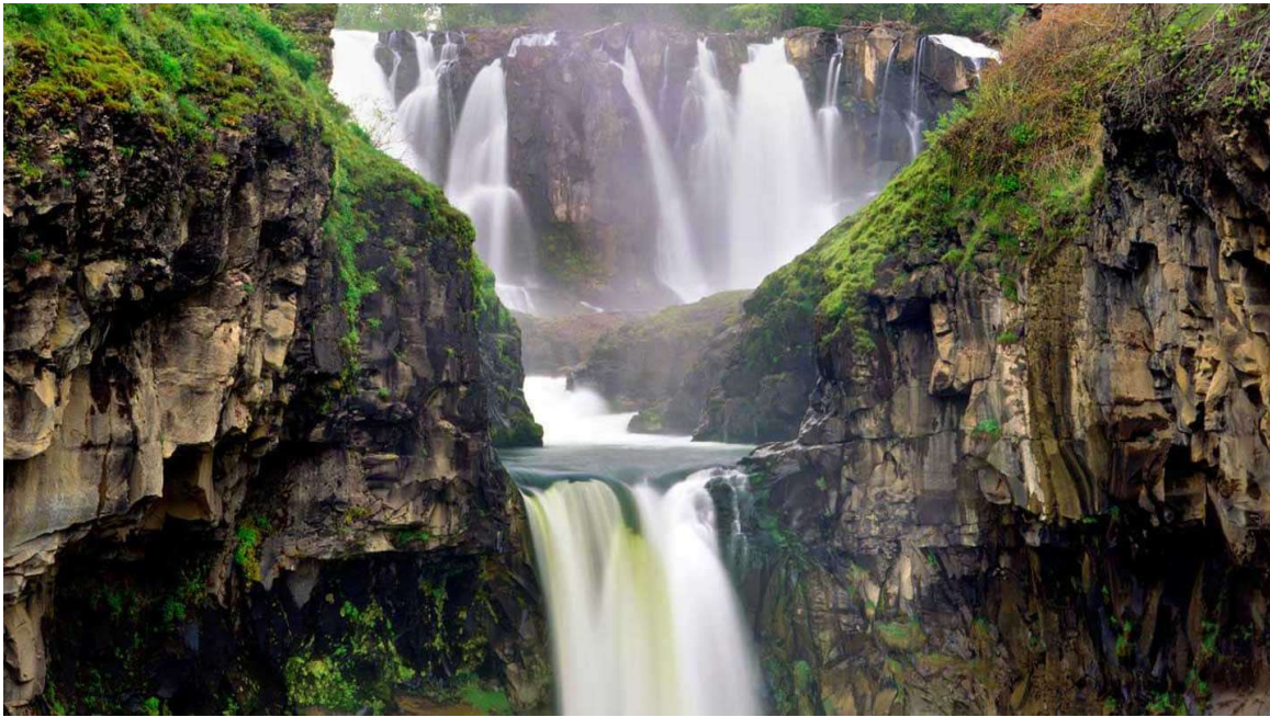
White River Falls