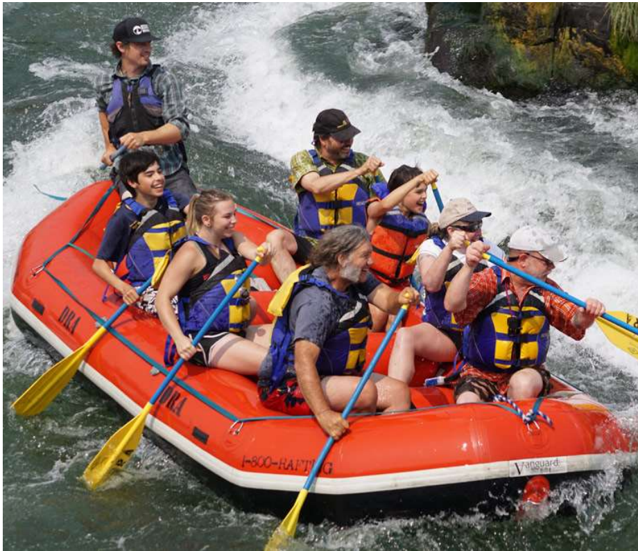
Rafting World Class Deschutes River