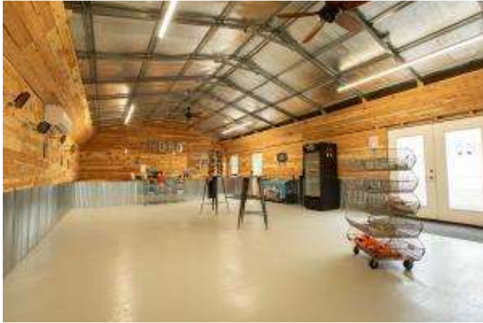
Sales Area, Showroom & Sales Counter