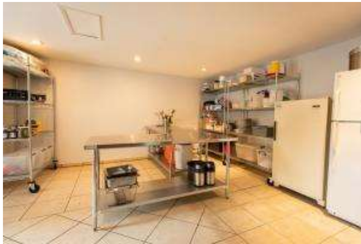
Prep Kitchen below main house