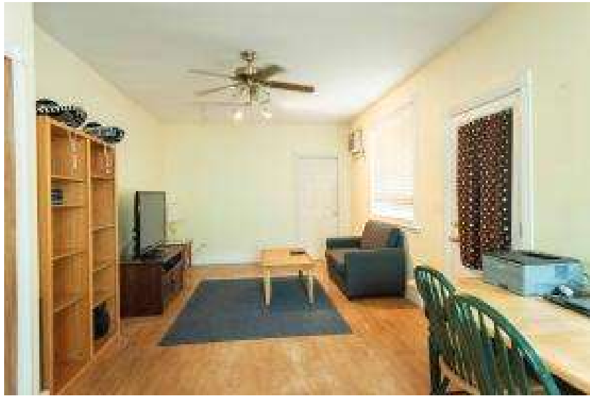
Great Room of 2 Bedroom 1.5/Bath House