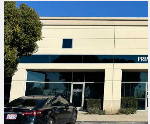
Unit K ±4,142 Sq Ft 2 Ground-Level Doors