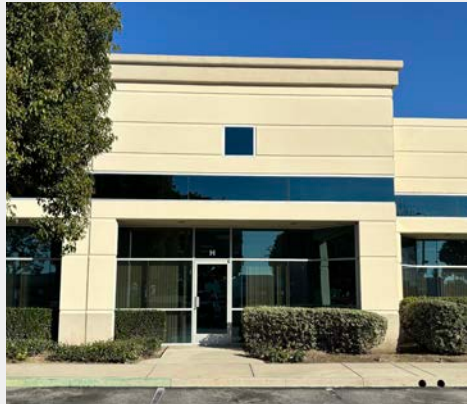
Unit H ±3,442 Sq Ft 1 Ground-Level Door