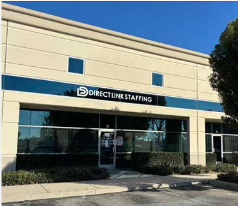
Unit G ±2,343 Sq Ft 1 Ground-Level Door