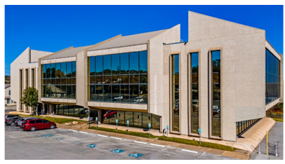
4204 GARDENDALE ST