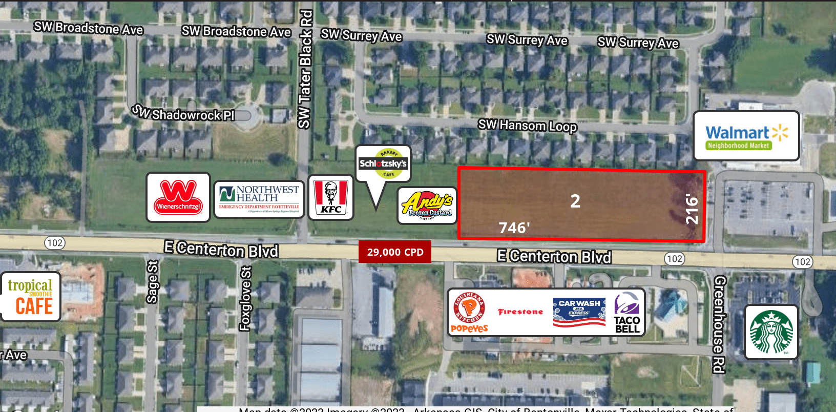
Map data ©2023 Imagery ©2023, Arkansas GIS, City of Bentonville, Maxar Technologies, State of