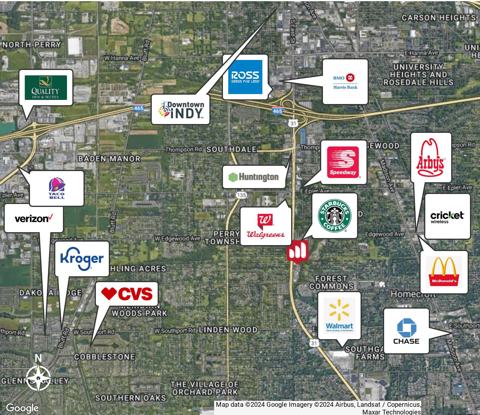
Map data ©2024 Google Imagery ©2024 Airbus, Landsat / Copernicus, Maxar Technologies