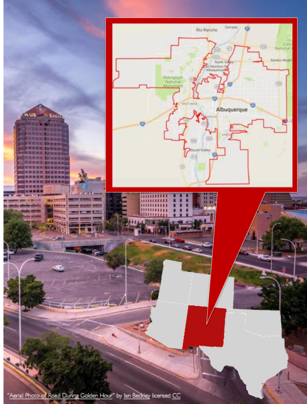
"Aerial Photo of Road During Golden Hour" by Ian Beckley licensed CC

FOR SALE / 2301 CHELWOOD PARK BLVD. NE, ALBUQUERQUE, NM 87112