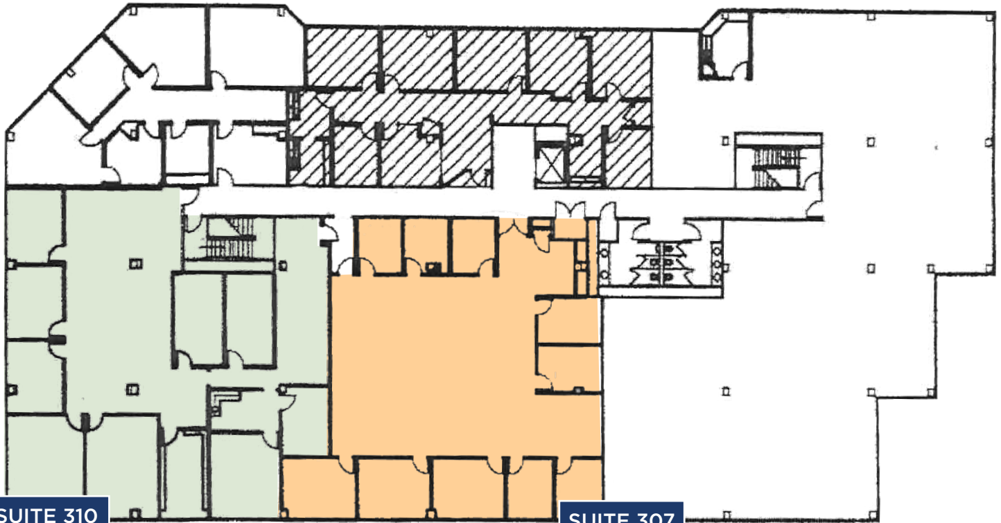
SUITE 310 4,212 SF