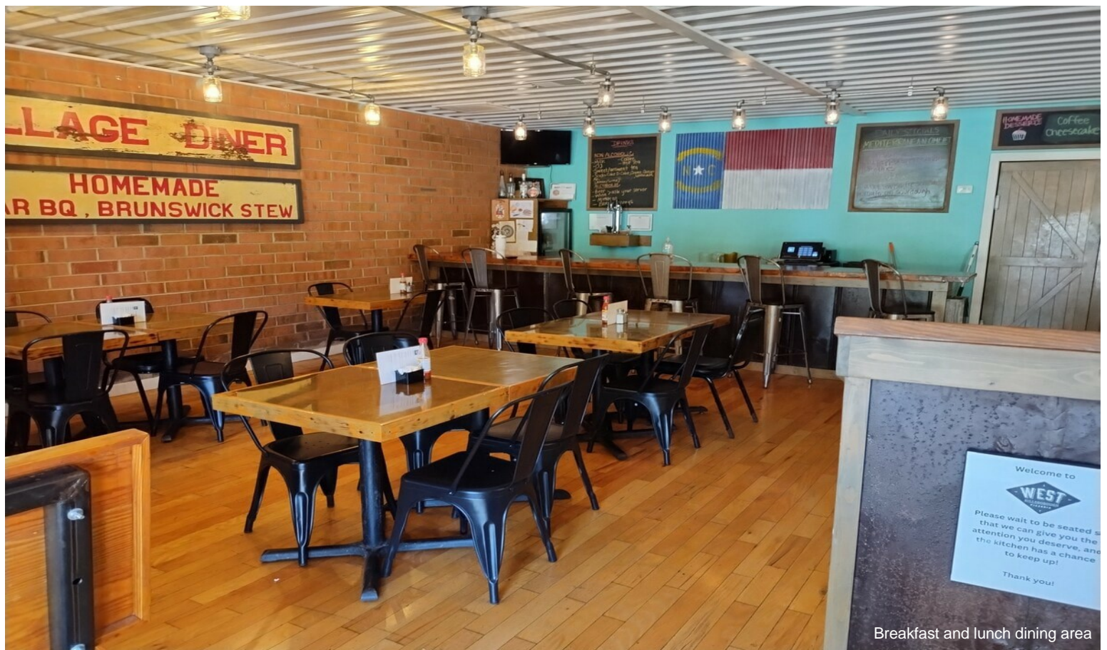
Breakfast and lunch dining area