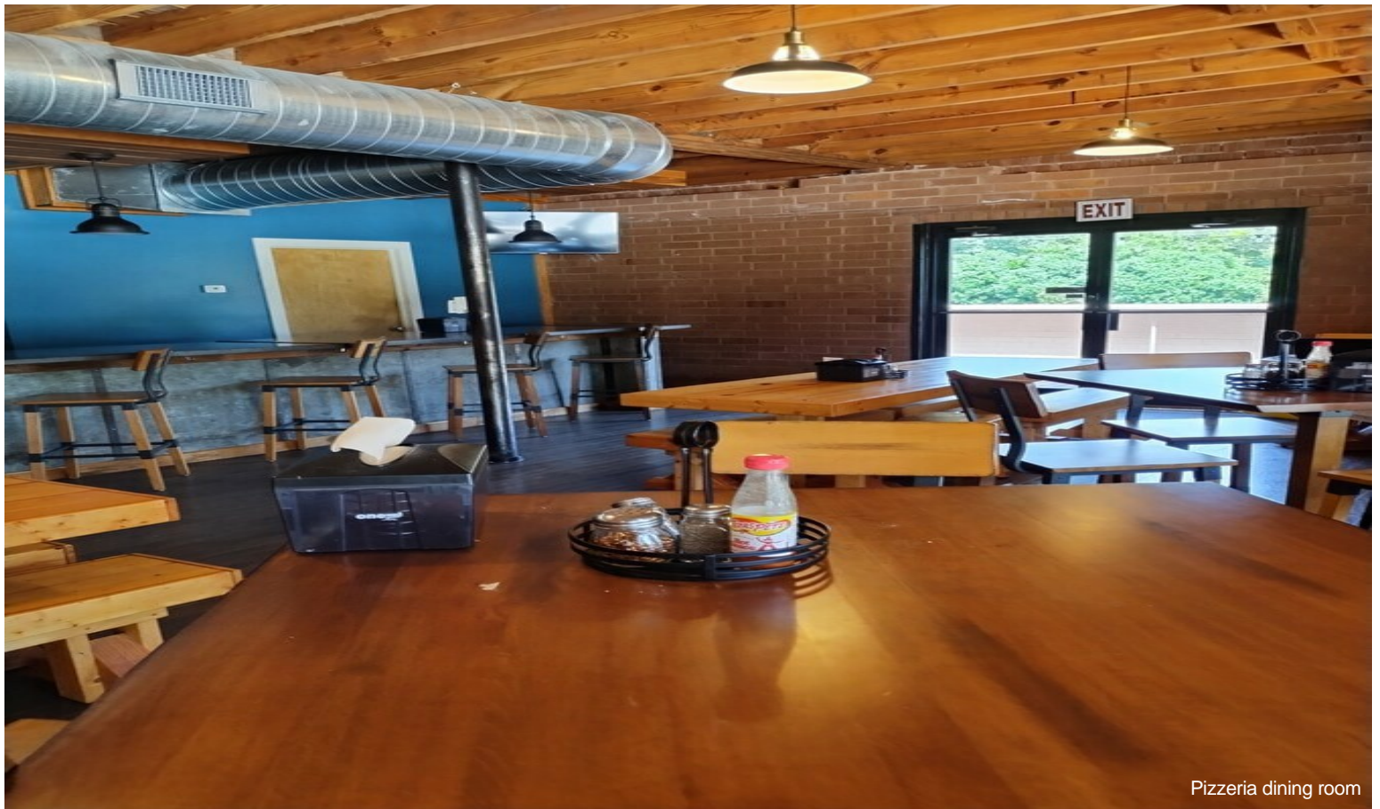
Pizzeria dining room