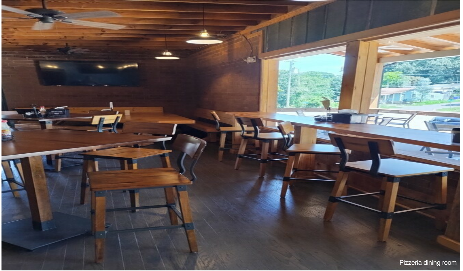
Pizzeria dining room