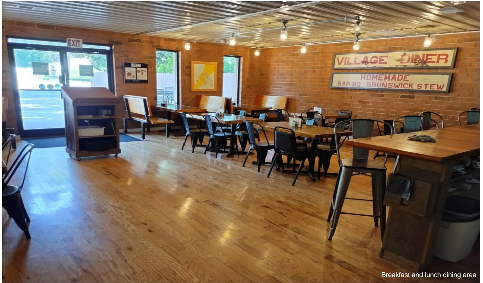
Breakfast and lunch dining area