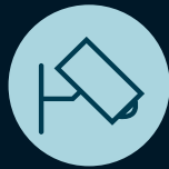
24-7 Building Security