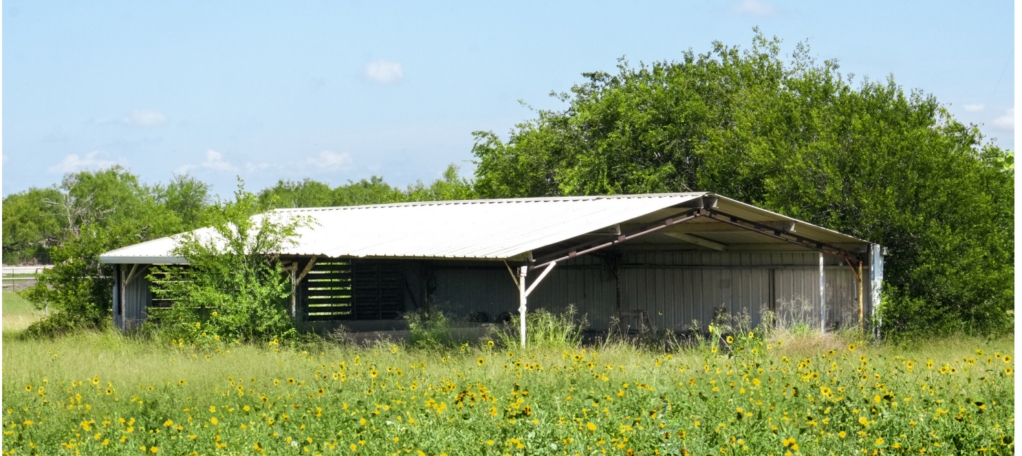
Additional 1,500 SF shed for storage or auxiliary use