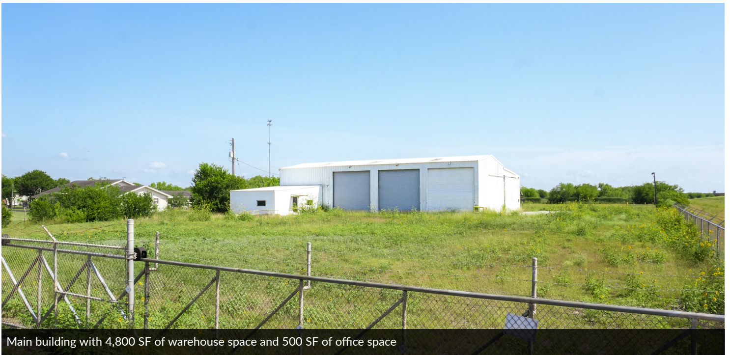
Main building with 4,800 SF of warehouse space and 500 SF of office space