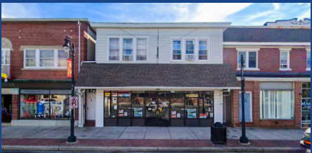
208 PHILADELPHIA AVENUE