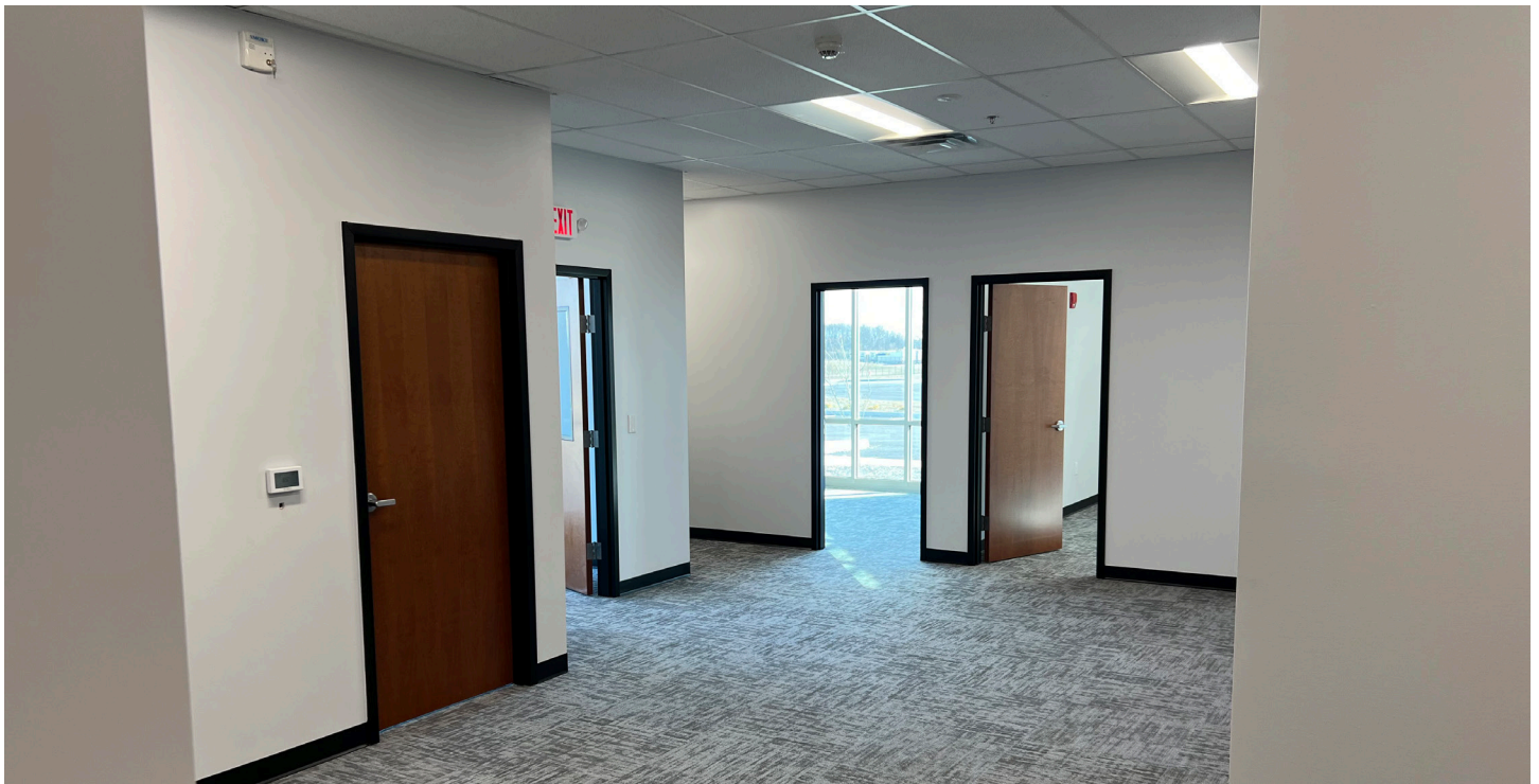
+/- 2,500 SF Spec Office