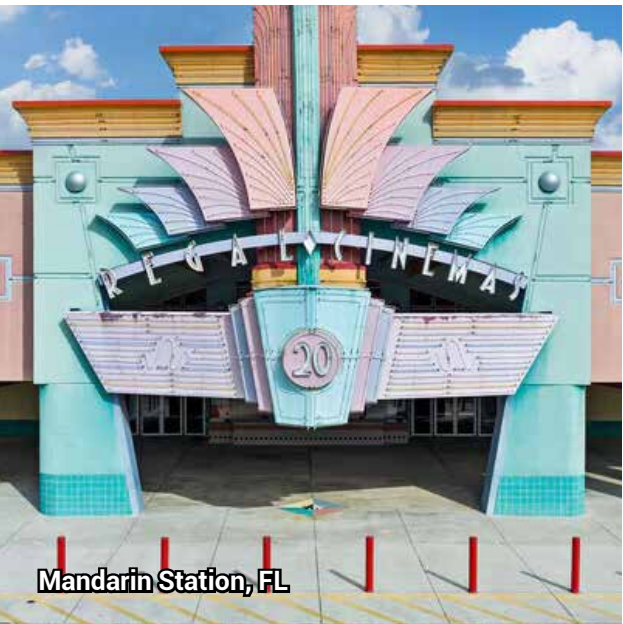
Mandarin Station, FL