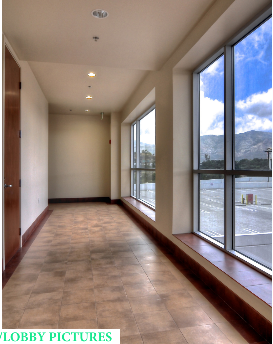
COMMON AREA/LOBBY PICTURES