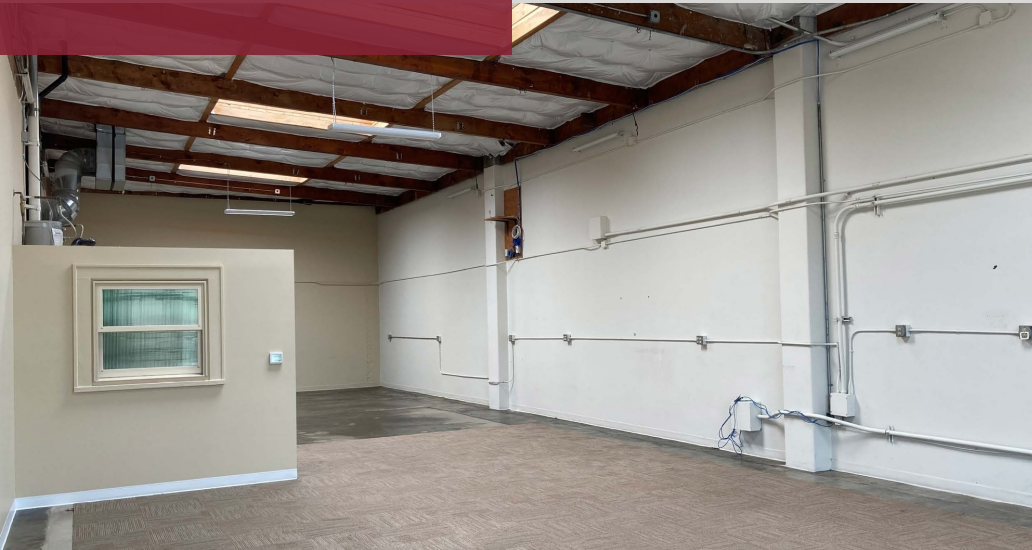
2421 SE 11th Avenue - Interior

2421-2455 SE 11th Avenue, Portland, OR 97214