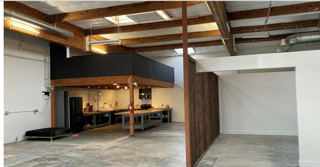
2429 SE 11th Avenue - Interior