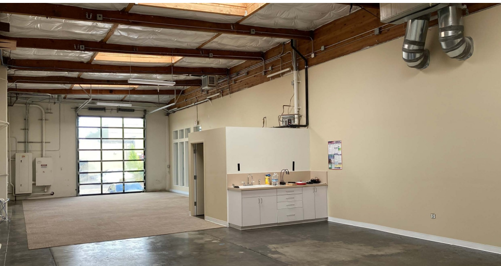
2421 SE 11th Avenue - Interior