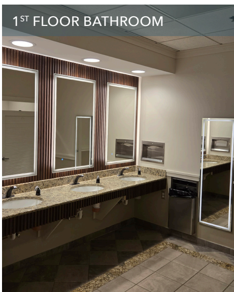
1 ST FLOOR BATHROOM