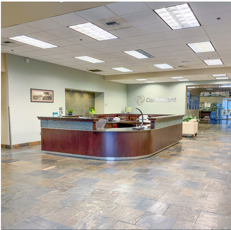
Optional Reception Area