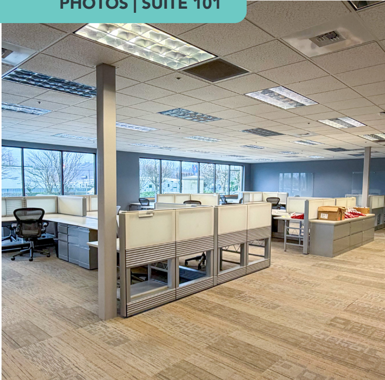
Abundant Natural Light