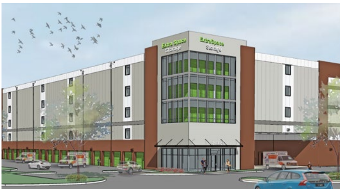
▲ 981 Waugh Chapel Way, self-storage rendering