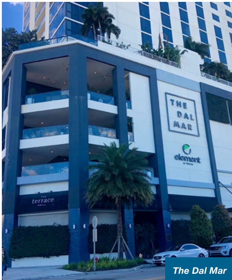
The Dal Mar

The 115 Parking Lot is ideally located in the thriving and emerging Flagler Village neighborhood in downtown Fort Lauderdale, and sits between 3rd Avenue to its east and Andrews Avenue to its west. The lot rests in the spine of downtown. Flagler Village includes multi-family residential, retail, office and numerous hotels.