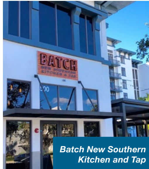
Batch New Southern Kitchen and Tap