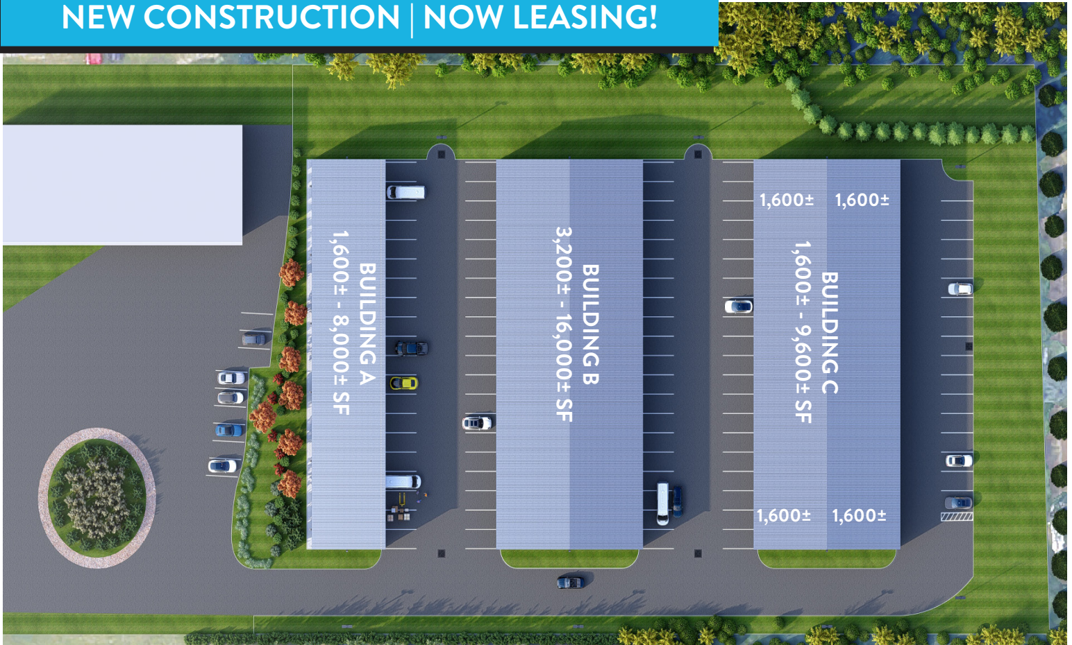
Rendering. This is an example only and subject to change.