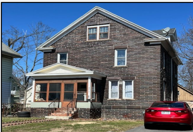
472 Lexington St, Rochester, NY 14613