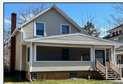
34 Brooklyn St, Rochester, NY 14613