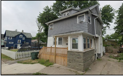
14 Parker Pl, Rochester, NY 14608