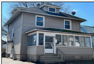
9 Welstead Pl, Rochester, NY 14613