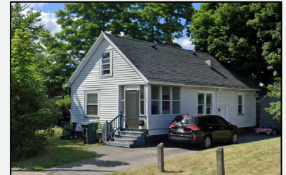
12 Chapel St, Rochester, NY 14609