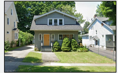
191 Curlew St, Rochester, NY 14613