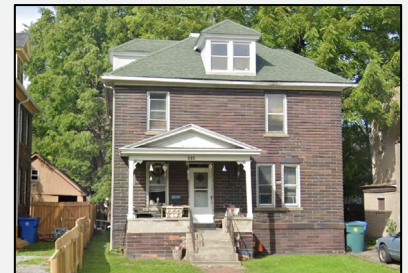
468 Lexington St, Rochester, NY 14613