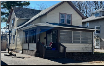
7 Welstead Pl, Rochester, NY 14613