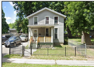
69 Reynolds St, Rochester, NY 14608