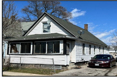
16 Vose St, Rochester, NY 14605