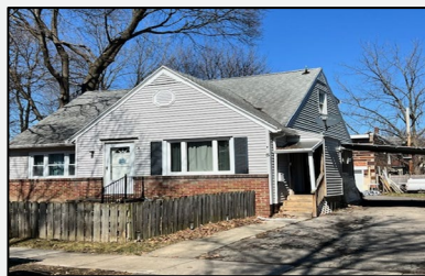
8 Welstead Pl, Rochester, NY 14613