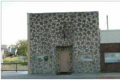
Pin 05-03-06-02-015-012.000 Photo