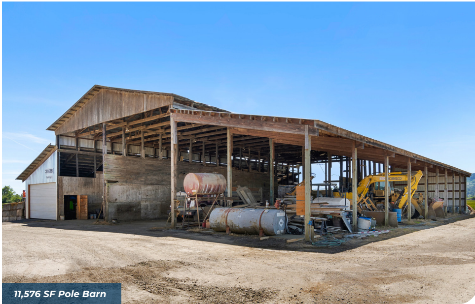
11,576 SF Pole Barn