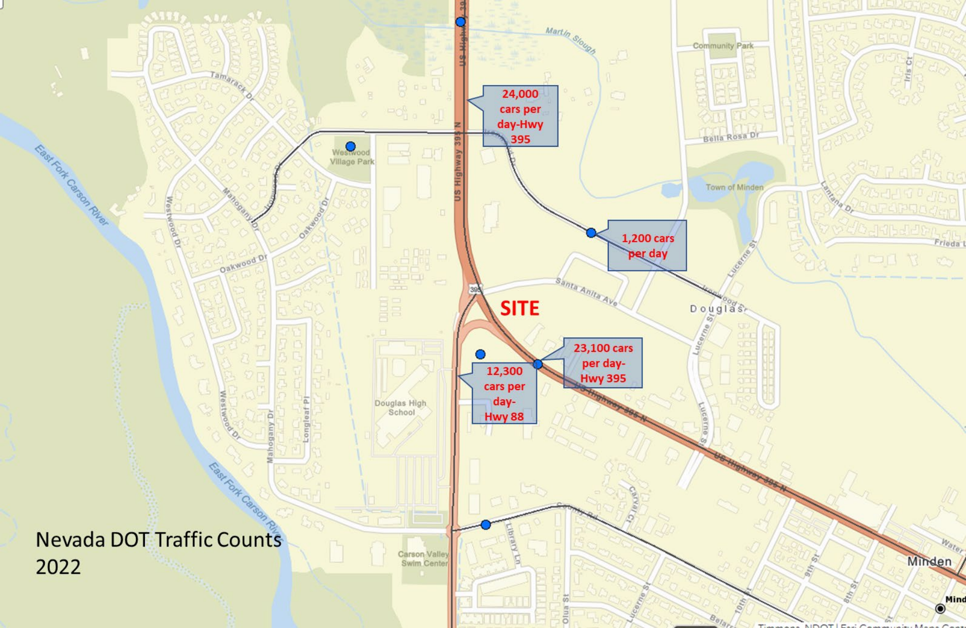
Nevada DOT Traffic Counts 2022