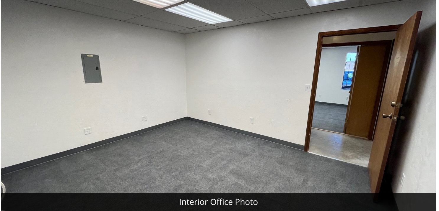
Interior Office Photo