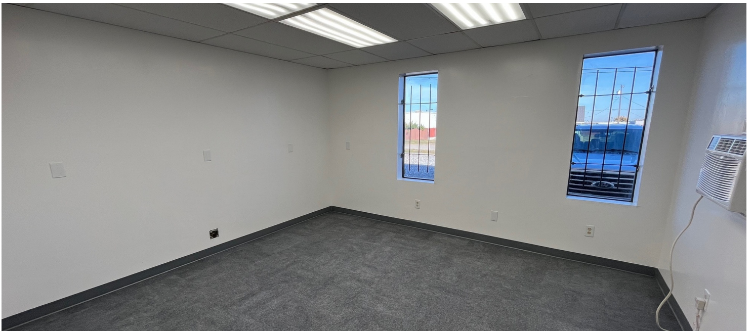
Interior Office Photo