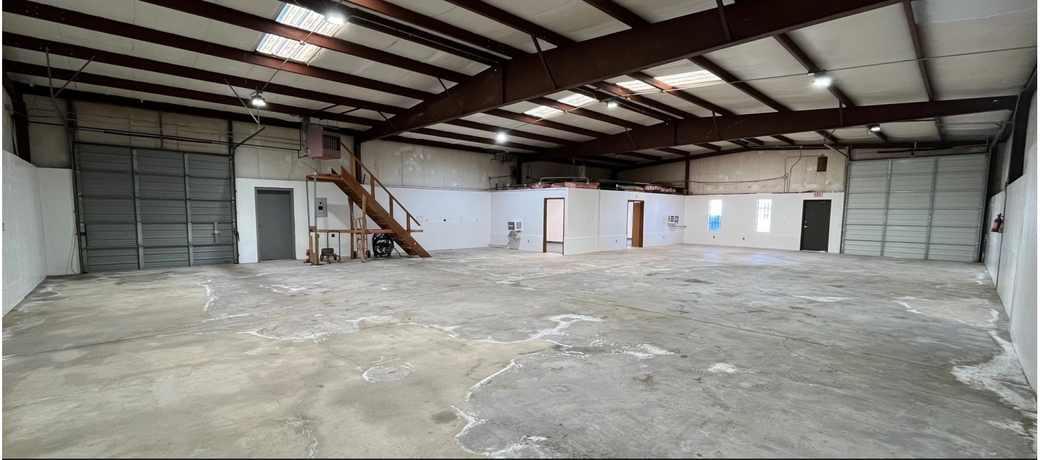
Interior Warehouse Photo