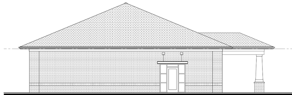
1 REAR ELEVATION 1/4" = 1'-0"