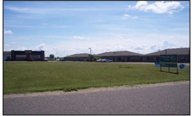
Lot from Enterprise Ave (from west)