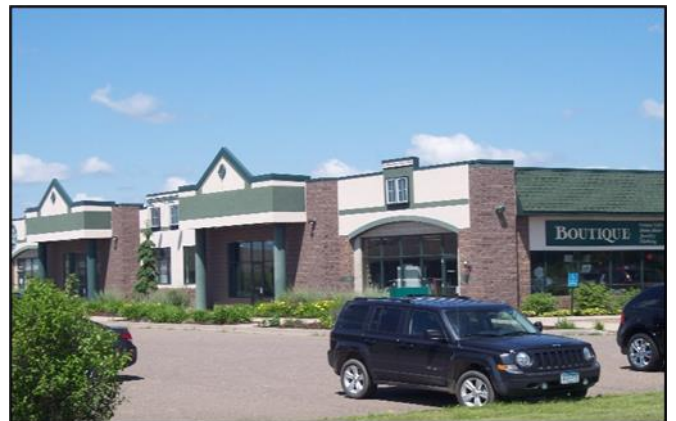
Front half from HWY 65 w/ retail building (from east)