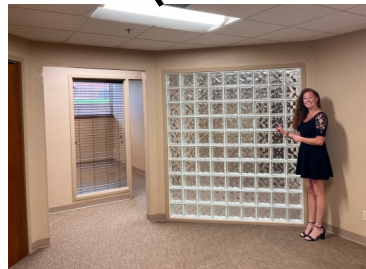
Cool glass accent wall!