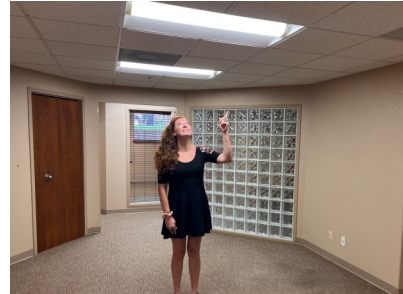
Updated LED lights