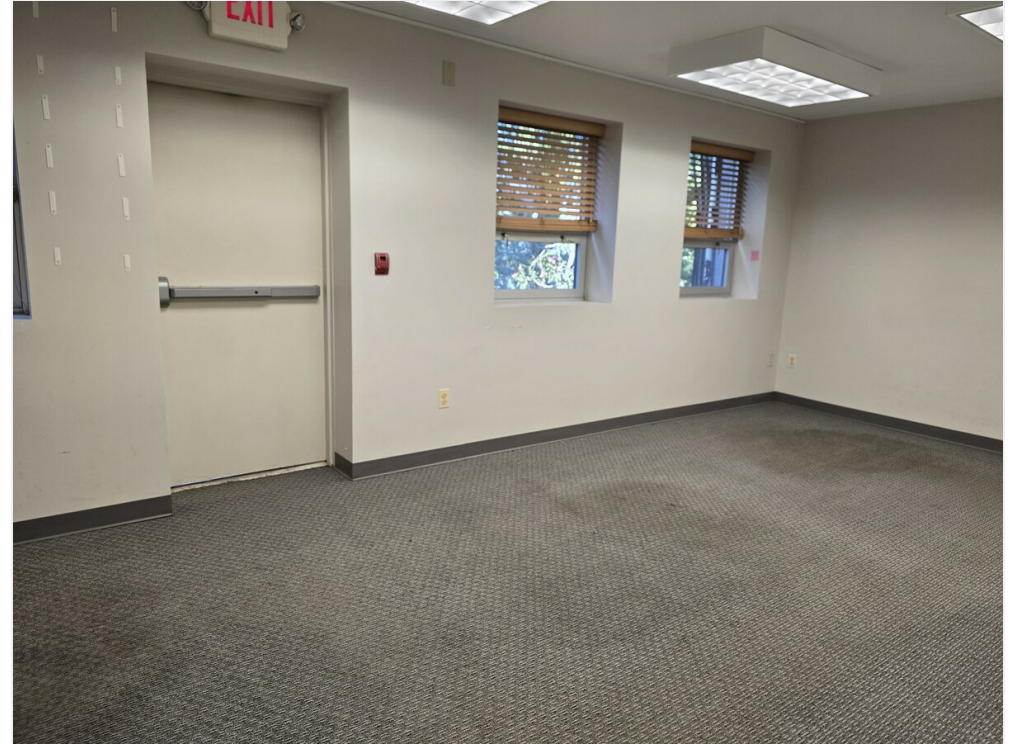
large private office