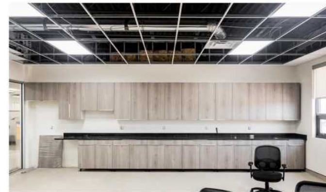
This first-generation turnkey office space features brand new systems, offering a seamless and fully equipped environment for immediate occupancy.