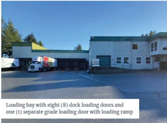
Loading bay with eight (8) dock loading doors and one (1) separate grade loading door with loading ramp