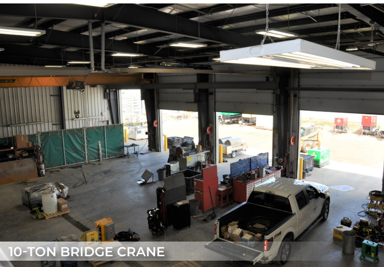
10-TON BRIDGE CRANE