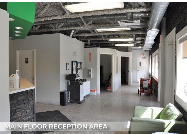
MAIN FLOOR RECEPTION AREA

For Sale/Lease | 7002 39 Street, Leduc, AB