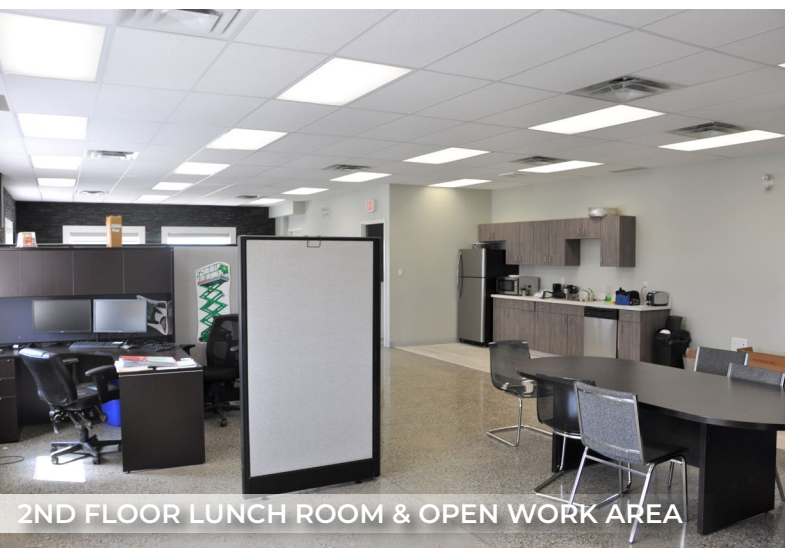
2ND FLOOR LUNCH ROOM & OPEN WORK AREA